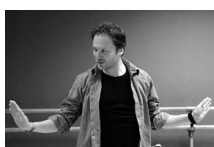
* NDT, photo D.Komen